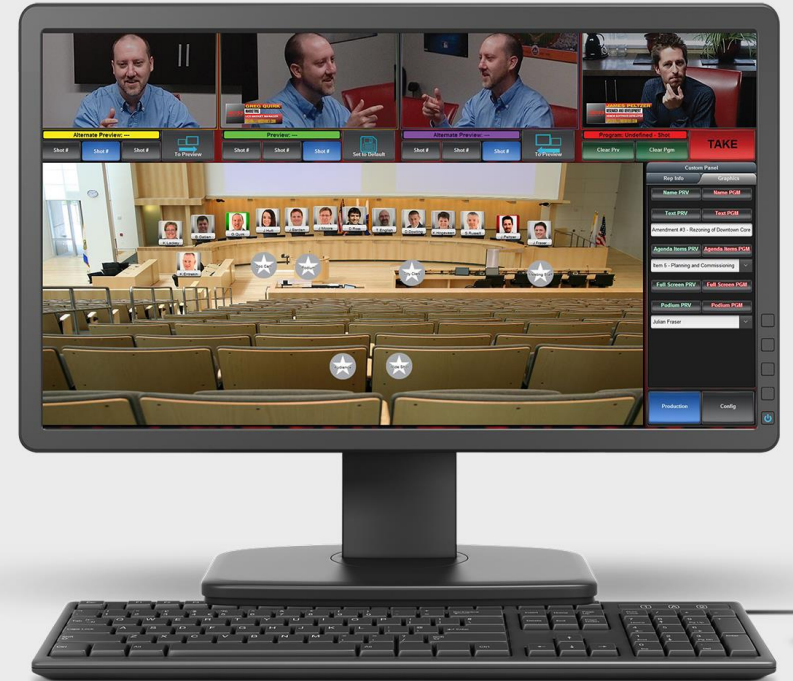
Lightning Control System v6.2.1