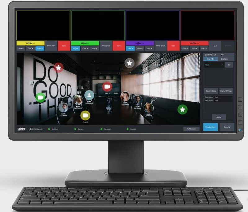
Proposed design for Lightning's Spring release