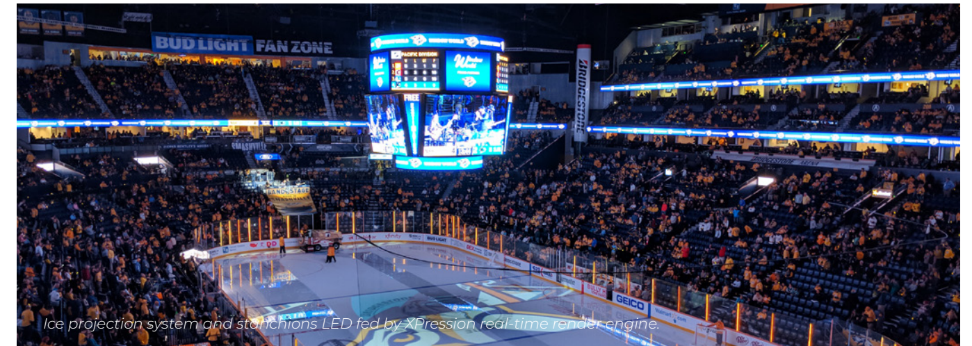
Ice projection system and stanchions LED fed by XPression real-time render engine.

The Predators' production team quickly became comfortable with the Unified Venue Solution workflow and have continued to dive into the unparalleled creative flexibility offered by the system. One of the most impressive aspects of the new production system is the creative use of the Ice Projection System, which is supported by real-time data and user input. Driven by an XPression system tied into the DashBoard control system, all elements projected onto the ice are linked directly to content on the LED displays as well as to the lighting and audio system in order to generate in-sync, show-stopping moments. The stanchion LED strips are also fed with XPression content and linked to the entire system.