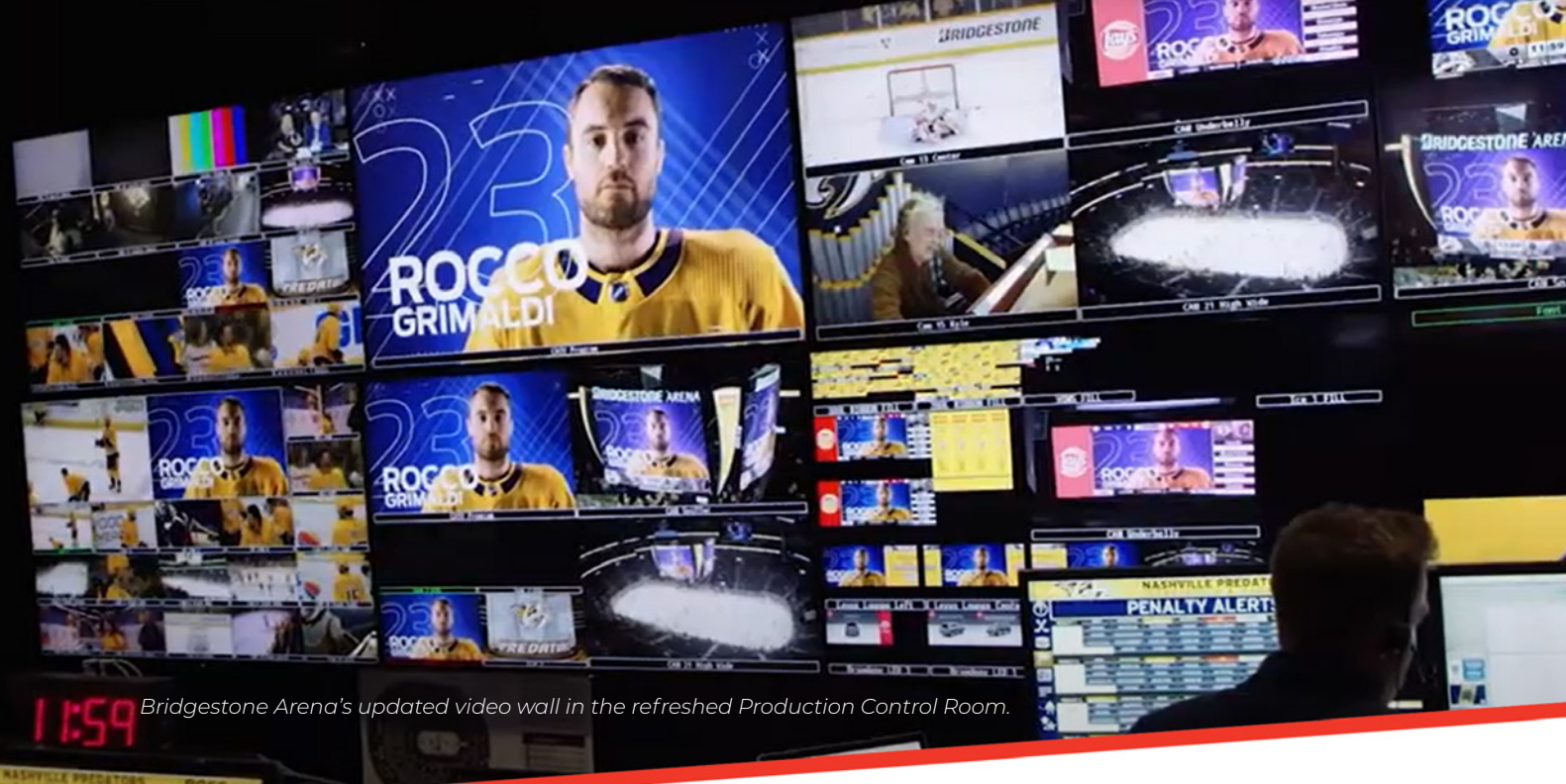
Bridgestone Arena's updated video wall in the refreshed Production Control Room.