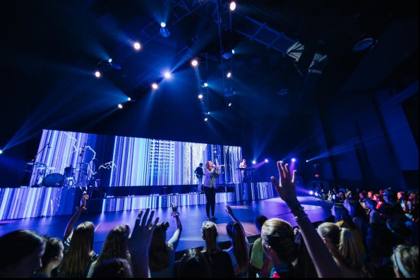
Worship & Faith