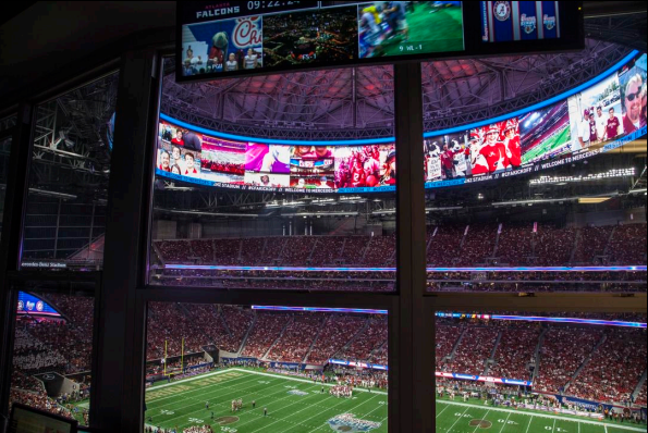
Sports & Live Broadcast