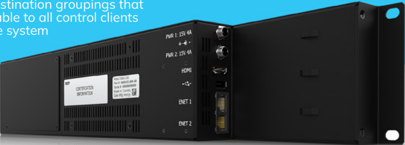
Ultricore - rear